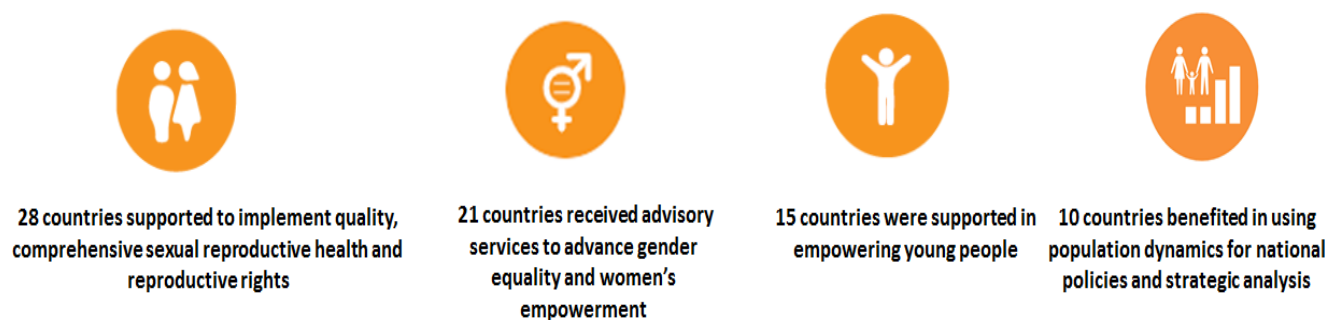
Figure 2. Selected results of regional technical and programme support

In spite of strong performance, a challenge in providing technical advisory support is the need for a more tailored country context approach, which is more time consuming and costly, due to the diversity of contexts within each region. Additional challenges include changes in national priorities or public structures (e.g. postponed census enumeration, renegotiation of commitment, etc.) and difficulties in managing multisectoral initiatives due to various sectoral priorities and procedures.