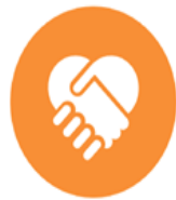
Figure 1. New regional partnerships for achieving Three Transformative Results

Latin America and the Caribbean regional office established new partnerships with the private sector, opening access to BlackRock’s research on population projections and advocacy for the Three Transformative Results through Grupo de Diarios América’s media platforms;