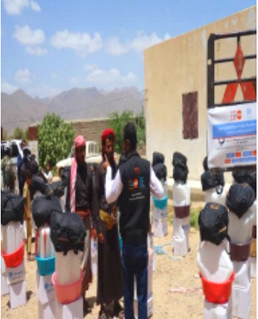
RRM distribution and mobile reproductive health teams at displaced camps in