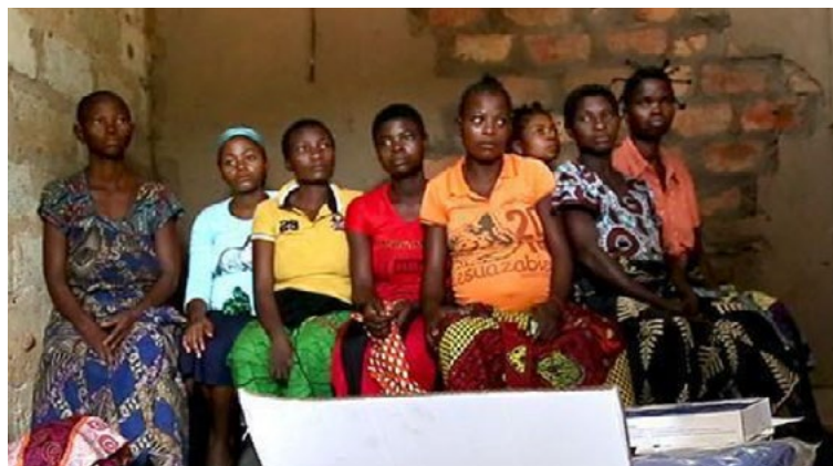
Pregnant women waiting to be screened at the Kalomba health centre during a UNFPA-supported mobile clinic.