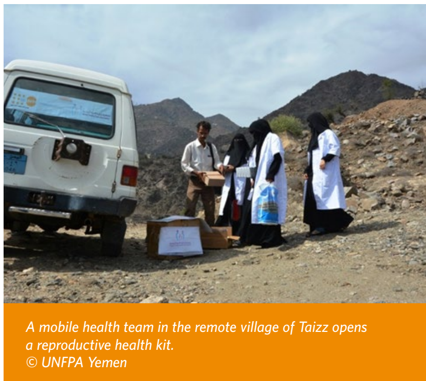
A mobile health team in the remote village of Taizz opens a reproductive health kit.

Three million women and girls are at risk of gender-based violence: The number of women seeking GBV services increased by 36 per cent in 2017. Rates of child marriage (marrying under the age of 18) jumped from 52 per cent of Yemeni girls in 2016 to nearly 66 per cent in 2017.