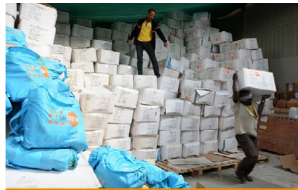
Warehouse with RH kits and dignity kits in Yemen, 2017.

Gender-based violence: UNFPA supports strengthening protection mechanisms including the engagement of men and boys as agents of change, in coordination with reproductive health programming.