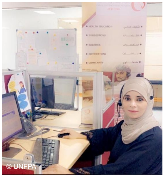
UNFPA GCC/OMAN: Telemedicine hotline to respond to pregnant women inquiries