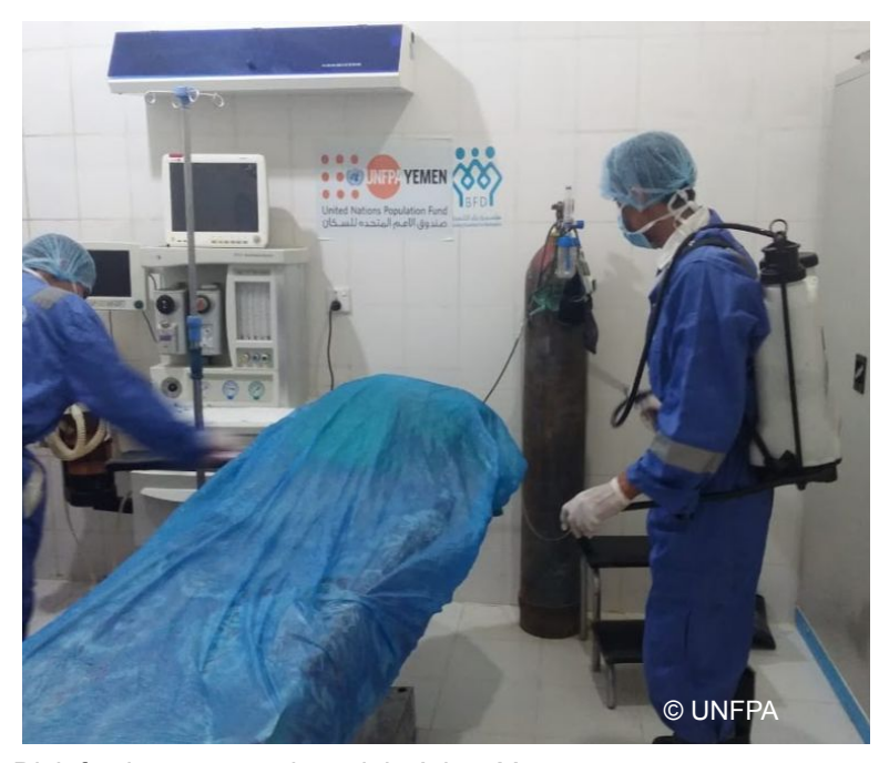
Disinfecting a maternity unit in Aden, Yemen.