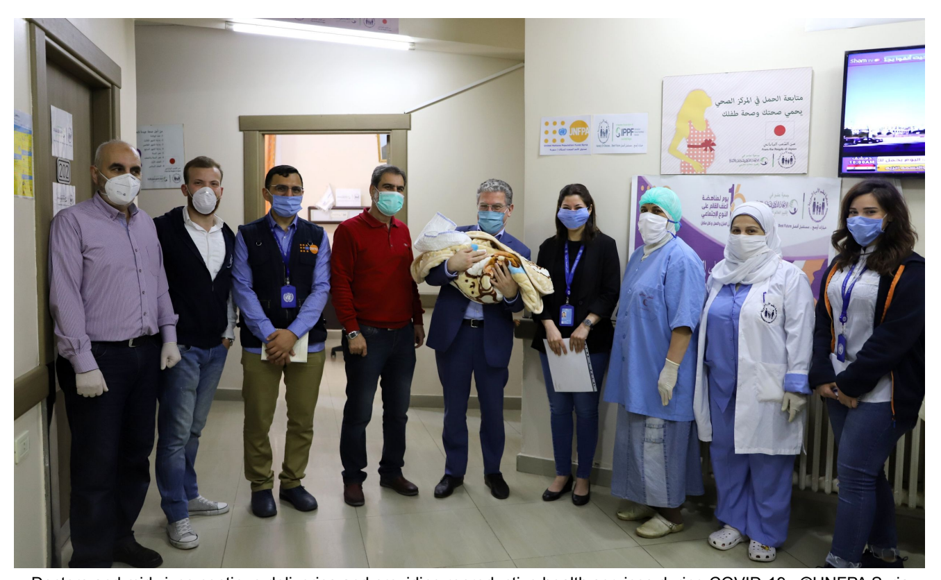
Doctors and midwives continue deliveries and providing reproductive health services during COVID-19.