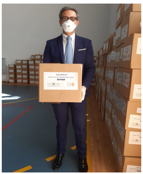
UNFPA Morocco: UNFPA and Ministry of Youth & Sports initiative, distributing hygiene kits