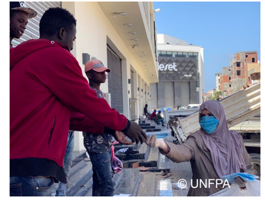
Distribution of face masks to migrants in open areas in Libya.