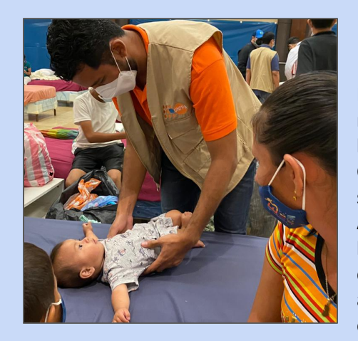
Nearly 12,000 people are staying in shelters following the deadly storm.

Regional level coordination supports country offices to respond to COVID-19 in line with the Global Humanitarian Response Plan (GHRP) and UNFPA's Global Response Plan. The GHRP covers multiple LAC countries with humanitarian needs. These are Colombia, Haiti and Venezuela, which have national humanitarian response plans and an additional 17 countries which are covered by the Refugee and Migrant Response Plan (RMRP) for a coordinated response to the needs of refugees and migrants from Venezuela. The RMRP has been revised to address the needs of refugees, migrants and host communities in the context of COVID-19, particularly as related to health and protection. UNFPA participates in the Regional Interagency Coordination Platform for Refugees and Migrants from Venezuela (R4V) and co-leads the GBV sub-sector. UNFPA also actively participates in the Regional Group on Risks, Emergencies and Disasters for Latin America and the Caribbean (REDLAC) including the health, protection, logistics and shelter sectors.