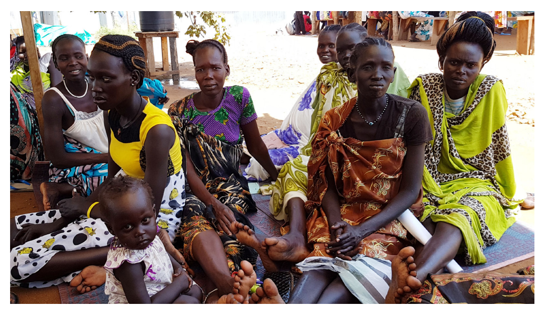
Women needing maternal care services wait to be served outside a health facility at a camp for internally-displaced population in Juba.