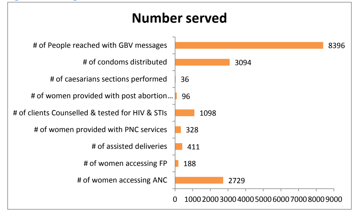
Figure 1: showing indicators and numbers of individuals served

The table below summarizes selected indicators of service delivery for the reporting week.