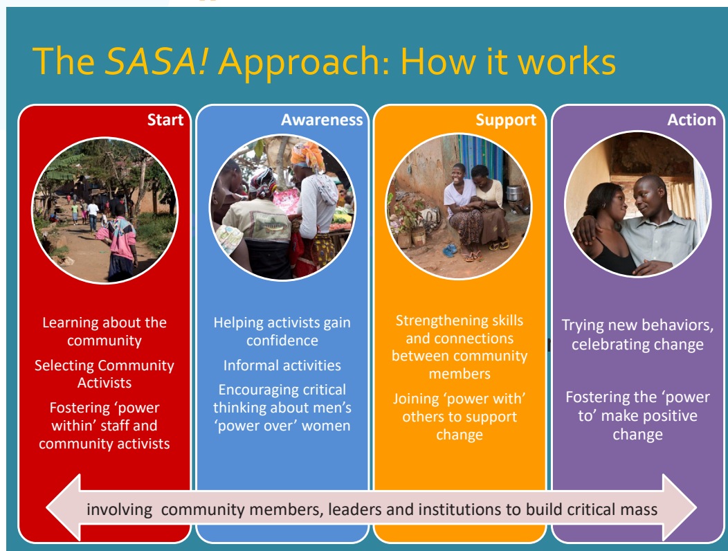
FIGURE 3: The SASA! approach

SASA!, < http://raisingvoices.org/sasa >.