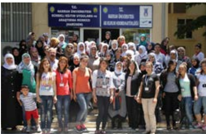
Syrian beneficiaries attending activities organized by Harran University, Turkey, Counseling Unit.

GENDER-BASED VIOLENCE SERVICES: During the reporting period, 30 cases received gender-based violence services. Of these, 20 cases received counseling, listening, psychosocial support, and case