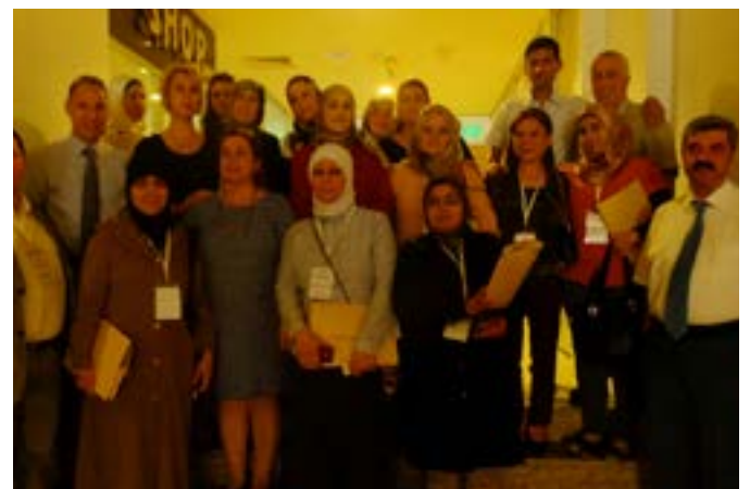
EMoC training: Syrian participants with their trainers from the Ministry of Health and UNFPA team, Adana, Turkey.