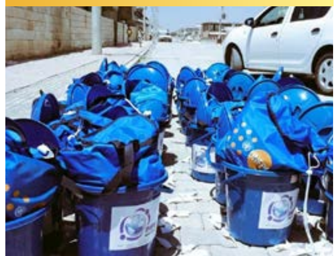
UNFPA through its partner, the International Middle East Peace Research Center (IMPR), distributed dignity kits to women fleeing from Tal Al-Abiad, Syria, and entering Turkey through Akcakale point.

In an effort to enhance partnerships with and raise awareness of beneficiaries about services available in the camp, seven awareness sessions were conducted at the UNFPA-IMC women and girls' centres,