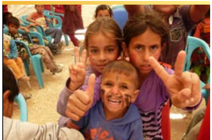
Syrian children with their mothers commemorating the World Refugee Day at UNFPA women's centre in Zaatari camp in Jordan.

UNFPA participated in the health sector coordination on monitoring and evaluation. During the meeting, members discussed the final list of indicators for monitoring and evaluation of primary health care interventions, and coordination with the Ministry of Health for qualitative indicators, satisfaction surveys, and automation of reporting.