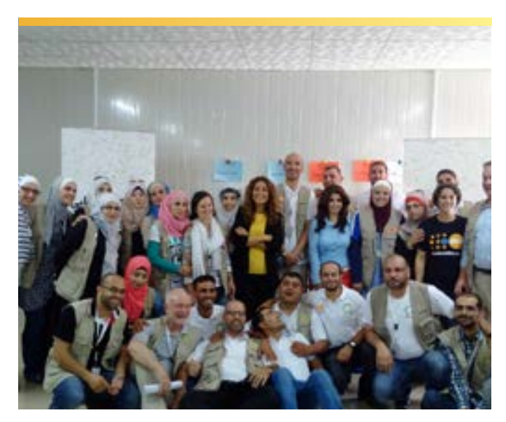
UNFPA and Questscope during the inauguration ceremony of the youth centre in Zaatari camp in Jordan.