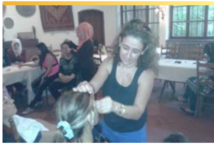
Al-Mithaq trainers in Lebanon conducting a hairdressing and make-up workshop for Syrian refugee women.

GENDER-BASED VIOLENCE TRAINING: A total of 75 women and girls in Domiz and Gawilan camps were trained on community-based interventions to prevent gender-based violence. The training enabled them to address the risks associated with gender-based violence, to advocate for the rights of women and girls, as well as