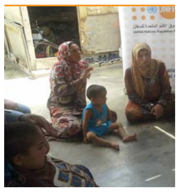
A community health worker of the International Medical Corps conducting an awareness session in an informal tented settlement in Al Marj, Bekaa, Lebanon.