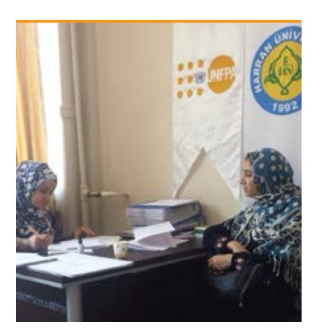
Syrian women visiting UNFPA women counselling unit in the Harran University in Sanlıurfa, Turkey.