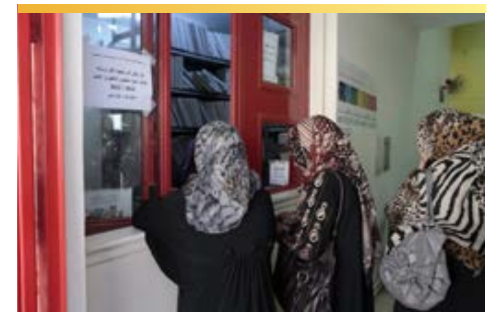
Syrian women standing in line to recieve medicine at the UNFPA-supported women's centre in Suweileh, Jordan.