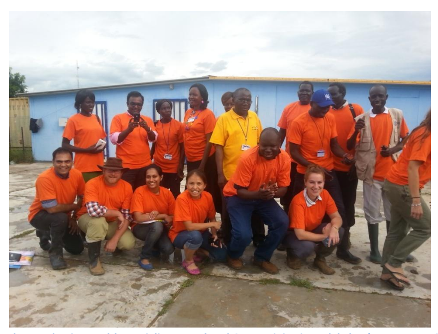
GBV and Reproductive Health specialists completed CMR training in Malakal .