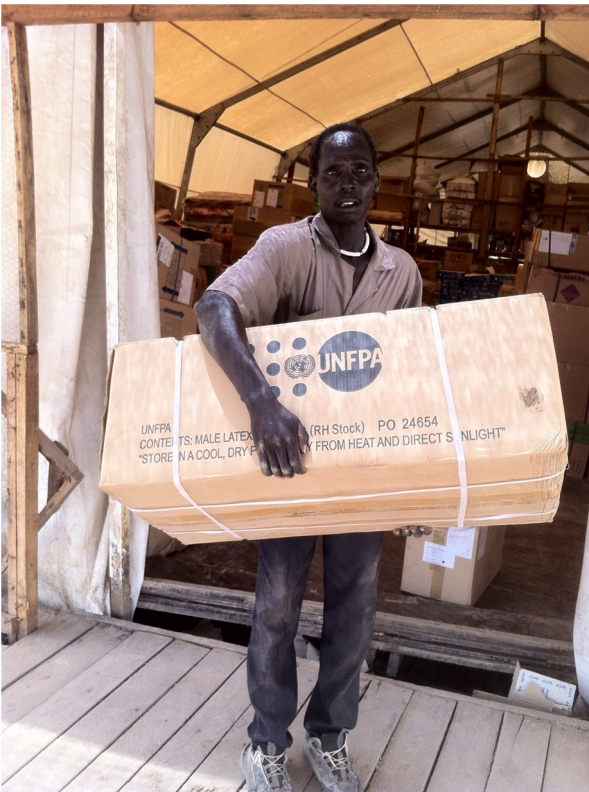
Male latex condom being placed in Health Cluster warehouse in Malakal before distribution.

UNFPA conducted training for 15 health workers from RH Implementing Partners, and State Ministry of Health on Minimum Initial Package (MISP) for Reproductive Health in Crises. The MISP training is the first of the 4 series of trainings planned under CERF project being implemented in Bentiu.