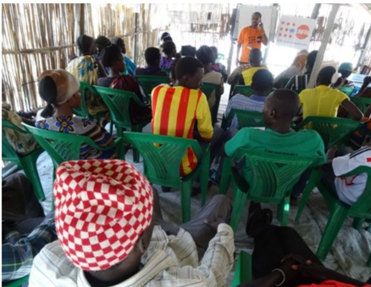
Youth groups in Malakal attending GBV training by UNFPA in collaboration with INTERSOS.

Case management and psychosocial support to women and girls is ongoing in all PoCs and IDP camp sites and information on the GBV available services is disseminated through door to door, blocks/zones meeting area, schools and health facilities through the community leaders meeting forums in all the PoCs.