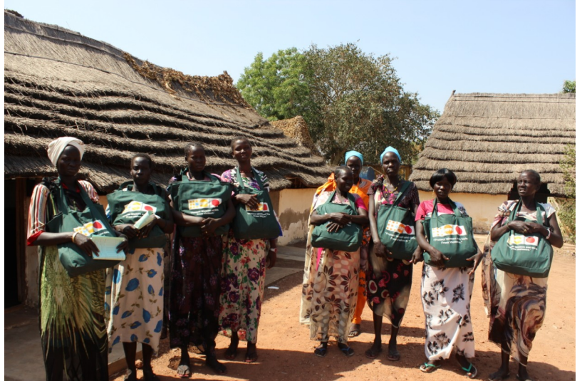
A group of women and girls of reproductive age who received dignity kits in Bentiu town.

In UN House PoC, Juba , 19 people (9 females and 7 males) GBV field officers were trained on GBV Basic concepts and referral path ways and community mobilization techniques. Advocacy is ongoing with the WASH clusters to increase water points and supply in PoC 3 to reduce risks of GBV to women and adolescent girls who are queuing for longer period and until dark to collect water and are experiencing harassment