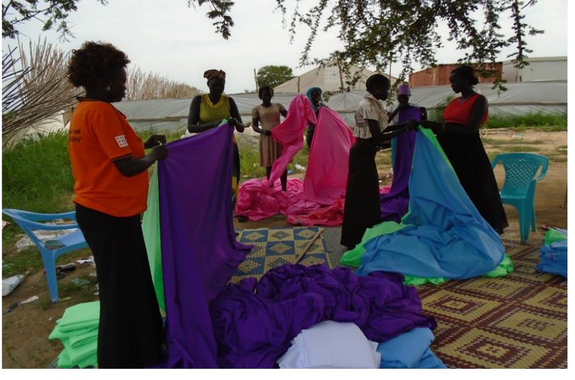
GBV staff cutting bed sheets in preparation for skills training classes in Mingkaman and Ahou Women Centres.

UNFPA partner HDC distributed 100 dignity kits