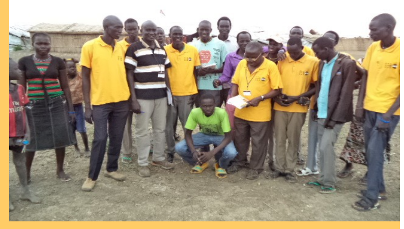
UNFPA staff meeting with Youth Peer Educators in Bentiu

UNFPA continues ensuring uninterrupted availability of RH Commodities, drugs, supplies and equipment in the country.