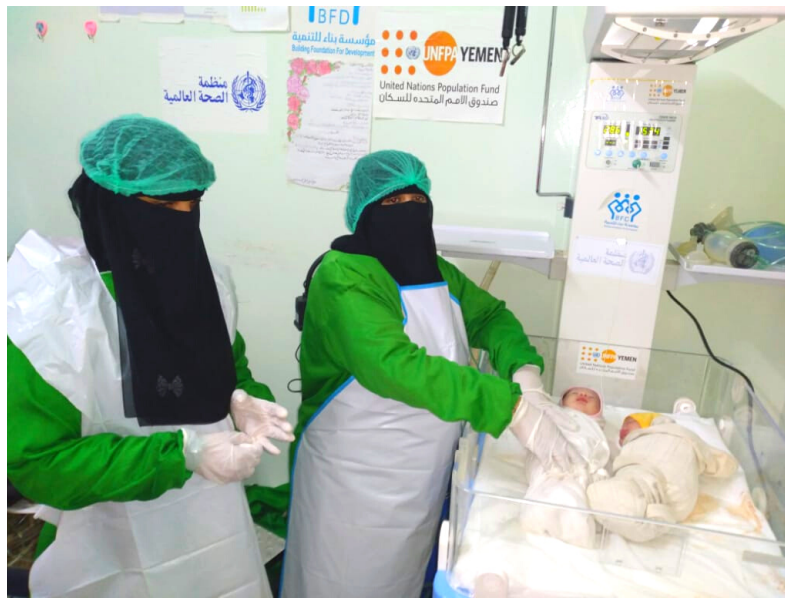
UNFPA-supported health facility in Hajjah safely delivers twins.