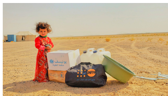
Distribution of rapid response kits to displaced families in Al Jawf Governorate.