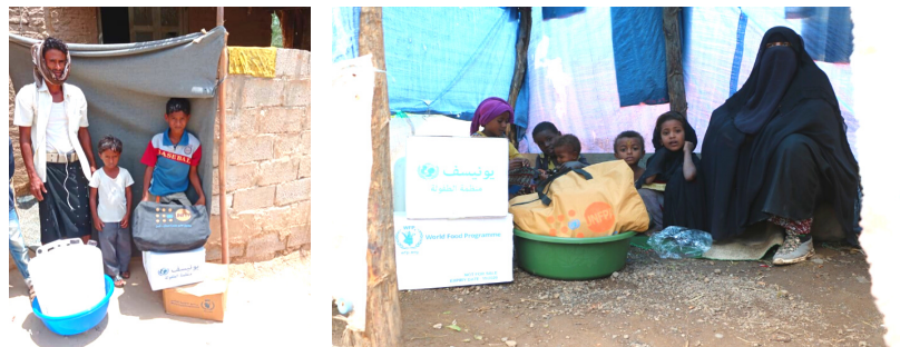
Distribution of rapid response kits to flood-affected families in Aden, Al Hudaydah and Ibb Governorates.