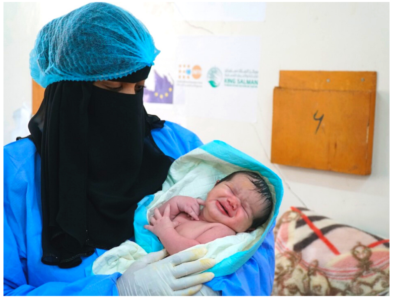
A safe delivery at a UNFPA-supported health facility in Al Dhale'