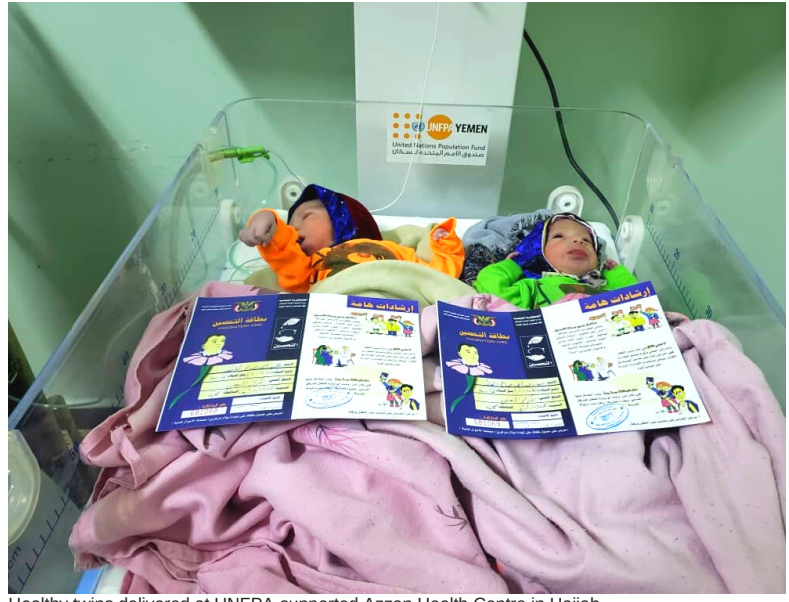
Healthy twins delivered at UNFPA-supported Azzan Health Centre in Hajjah