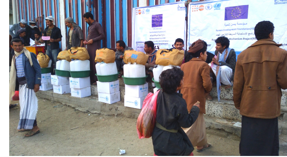
Distribution of rapid response kits in Sana'a, Al Hudaydah and Sa'ada Governorates.