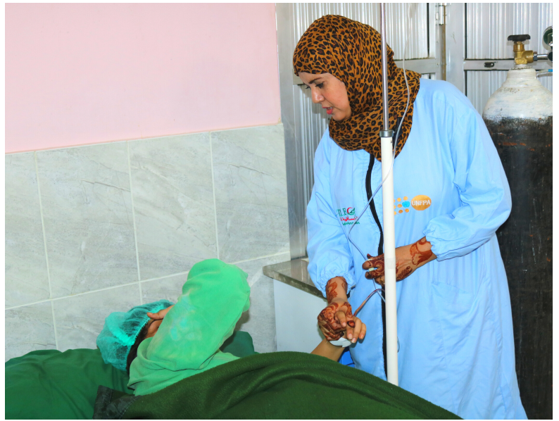
UNFPA-supported maternity unit at Al'Sha'ab Hospital in Aden