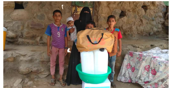
Displaced families with their RRM kits in Dhammar Governorate