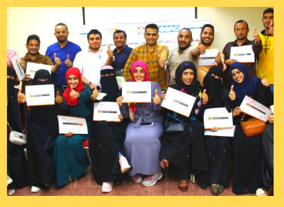
Yemeni youth gear up for the Nairobi Summit Read more...